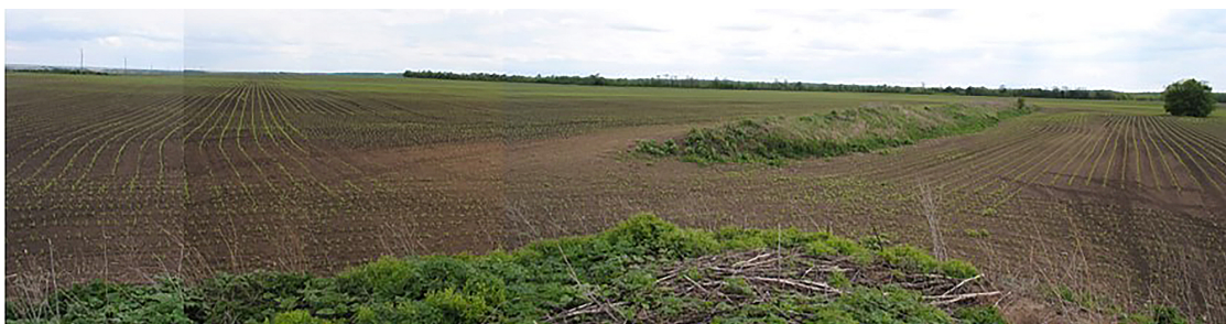
Figure 1. Panoramic depiction of the Sentyivshchansky fortress

The first detailed description of the Sentyiv fortification was made by the renowned historian and geographer J.-A. Gildenstedt, who described the journey through the region in detail. In his diary entries, the fortress as of May 26, 1774, appears as follows: "...a correctly four-cornered fortification measuring 400 fathoms in diameter, but it is uninhabited and is used only as a shelter in extreme cases" (Gildenstedt, 2023), meaning that at the time of the description, this fortification was no longer functioning as a permanent defence, was not provided with military garrison, and was intended only for extreme cases, which is understandable, as this description was made towards the end of the Russo-Turkish war of 1768-1774, when such fortifications in the interior of the empire lost their relevance (Fig. 1).